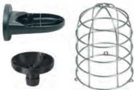
Plastic bracket, adaptor for tube mounting and wire guard (accessories)