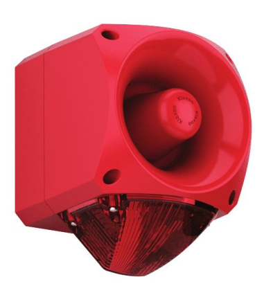
Applications - Conveyors; process control alarm; cranes; moving machinery; general signalling; marine